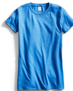
FREE Allmade® Youth Tri-Blend Tee AL207 | Youth Sizes: XS-XL | 7 colors