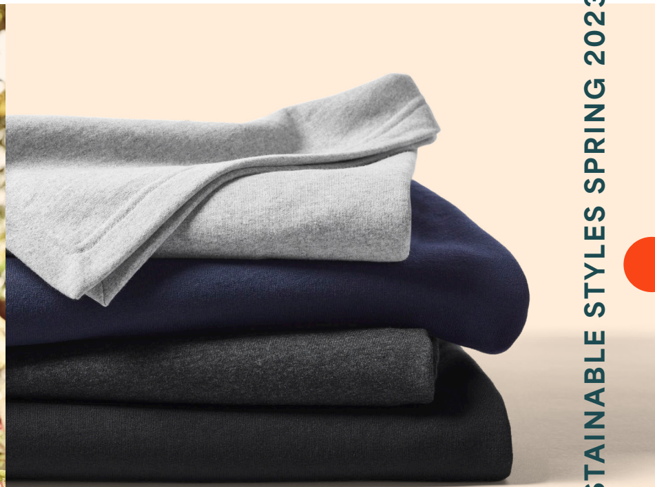
District® Re-Blanket™ DT81 | 4 colors