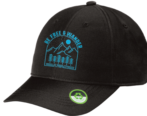
Port Authority® Eco Cap C954 | 4 colors