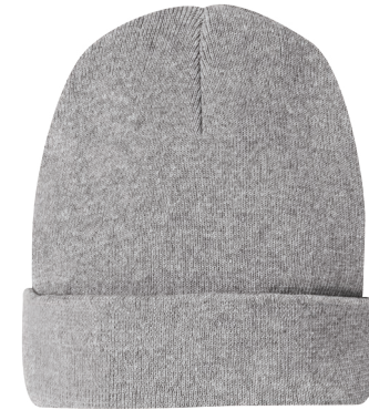
District® Re-Beanie™ DT815 | One Size Fits Most | 4 colors