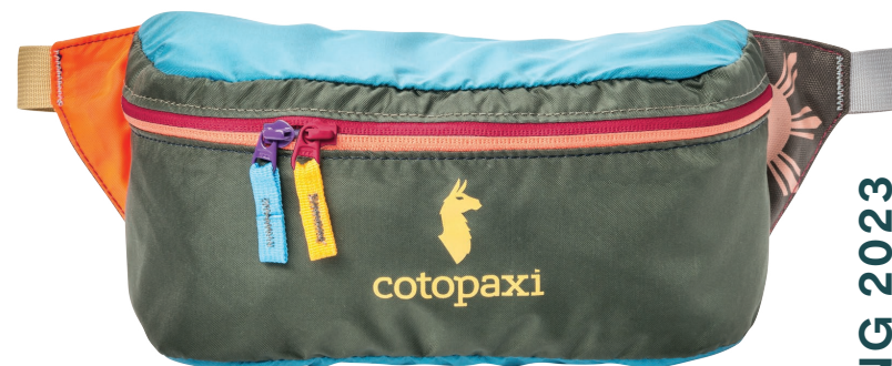
Cotopaxi Bataan Hip Pack COTOBFP | Color: Surprise