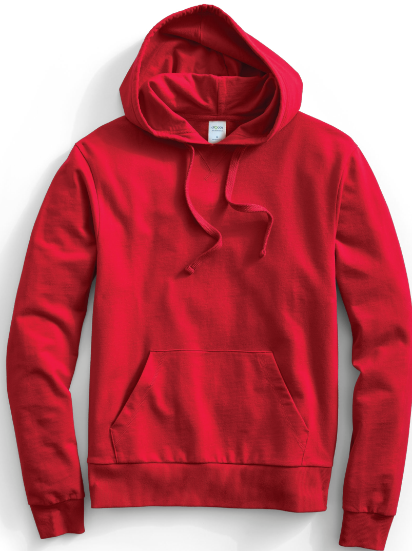
Allmade® Unisex French Terry Pullover Hoodie AL4000 | Unisex Sizes: XS-4XL | 6 colors

Allmade French terry styles and cotton tees are made from 100% organic cotton fabric.