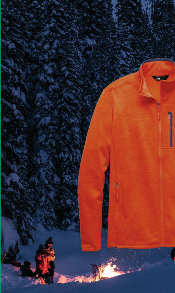
The North Face® Skyline Full-Zip Fleece Jacket NFOA7V64 | Adult Sizes: S-3XL | 5 colors