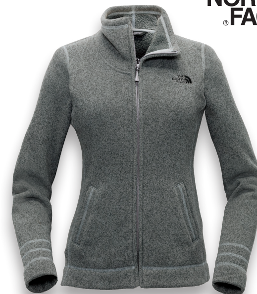
The North Face® Ladies Sweater Fleece Jacket NFOA3LH8 Ladies Sizes: S-2XL 2 Colors