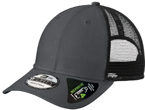
New Era® Recycled Snapback Cap NE208 | 5 colors