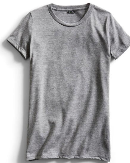
FREE Allmade® Women's Tri-Blend Tee AL2008 | Women's Sizes: XS-2XL | 9 colors