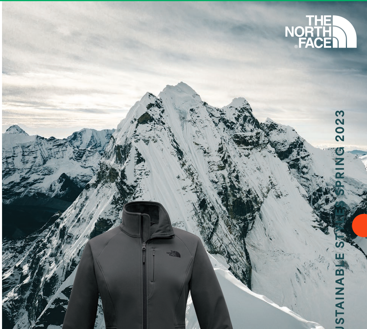
The North Face® Ladies Apex Barrier Soft Shell Jacket NF0A3LGU Ladies Sizes: S-2XL 3 Colors