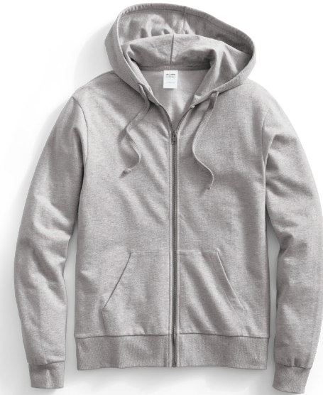
Allmade® Unisex French Terry Full Zip Hoodie AL4002 | Unisex Sizes: XS-4XL | 4 colors