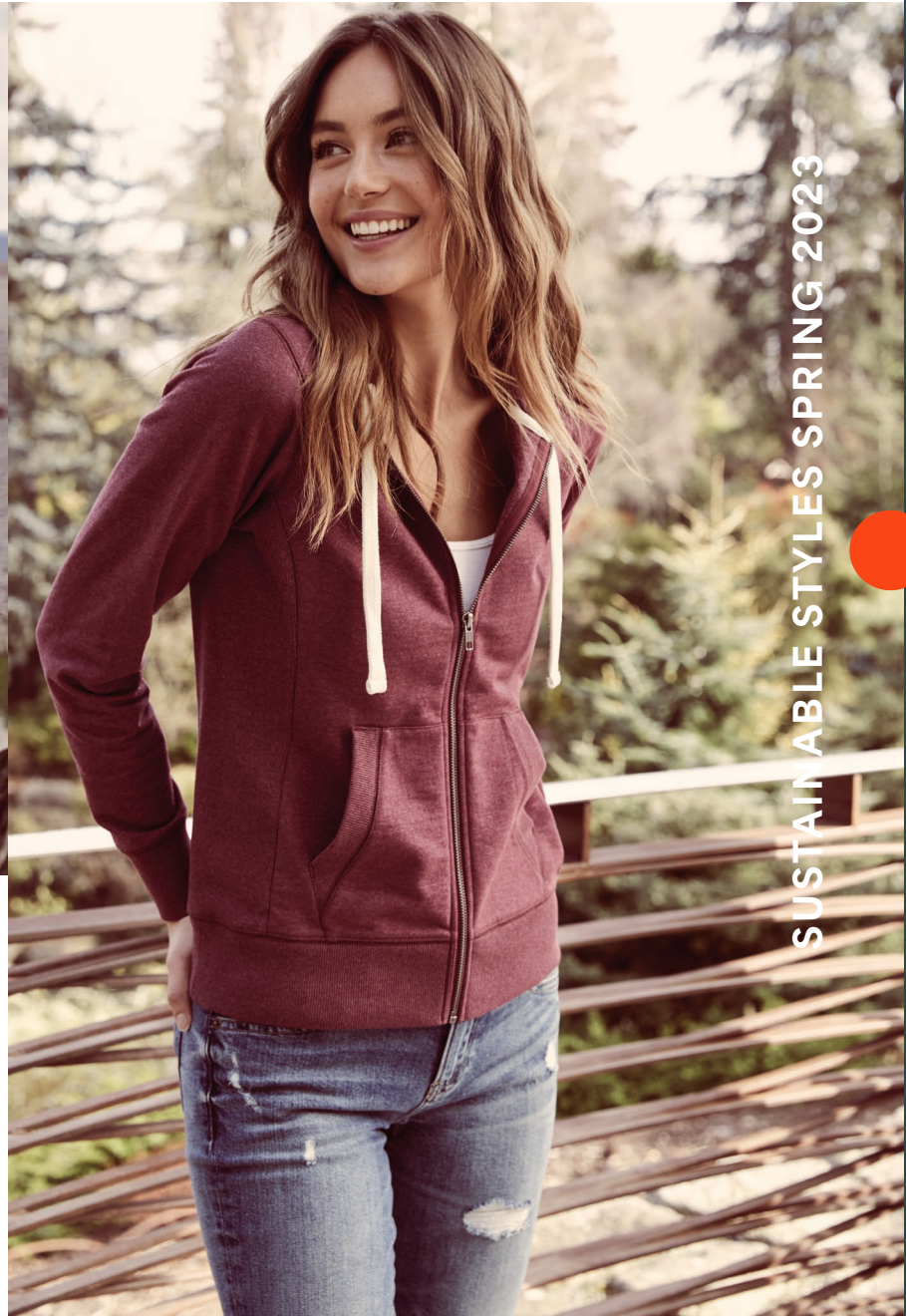
District® Women's Re-Fleece™ Full-Zip Hoodie DT8103 | Adult Sizes: XS-4XL | 5 colors