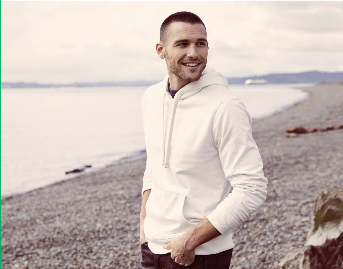
District® Re-Fleece™ Hoodie DT8100 | Adult Sizes: XS-4XL | 7 colors