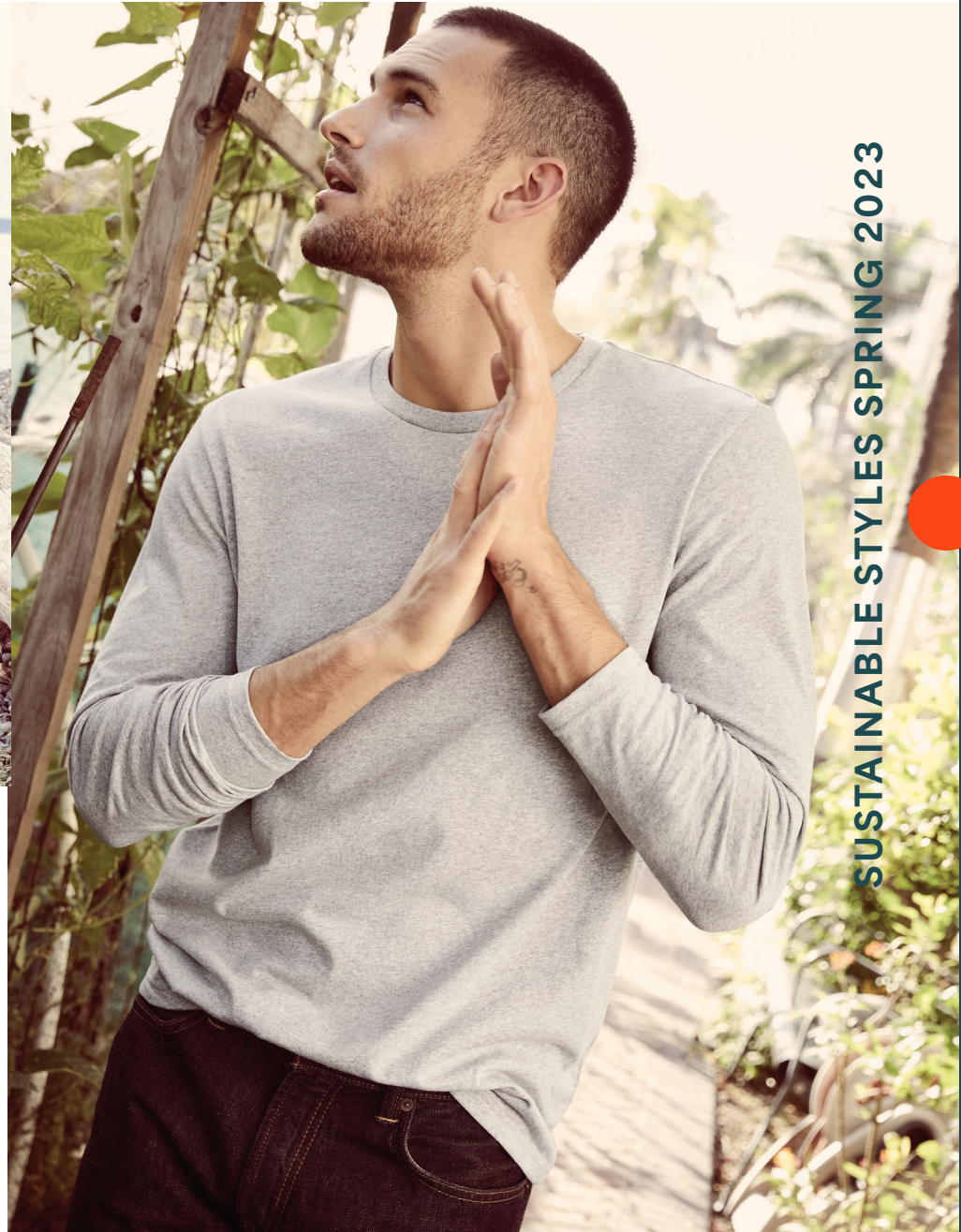
FREE District® Re-Tee® Long Sleeve DT8003 | Adult Sizes XS-4XL | 5 colors