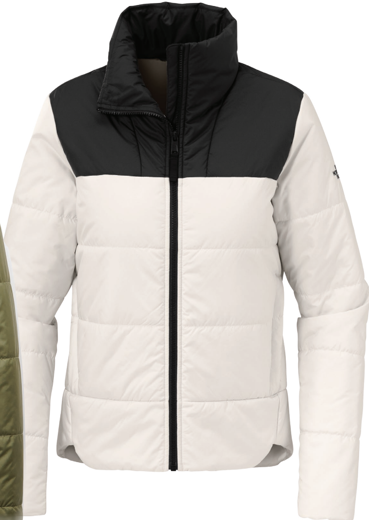
The North Face® Women's Everyday Insulated Jacket NFOA529L | Adult Sizes: XS-2XL | 3 colors