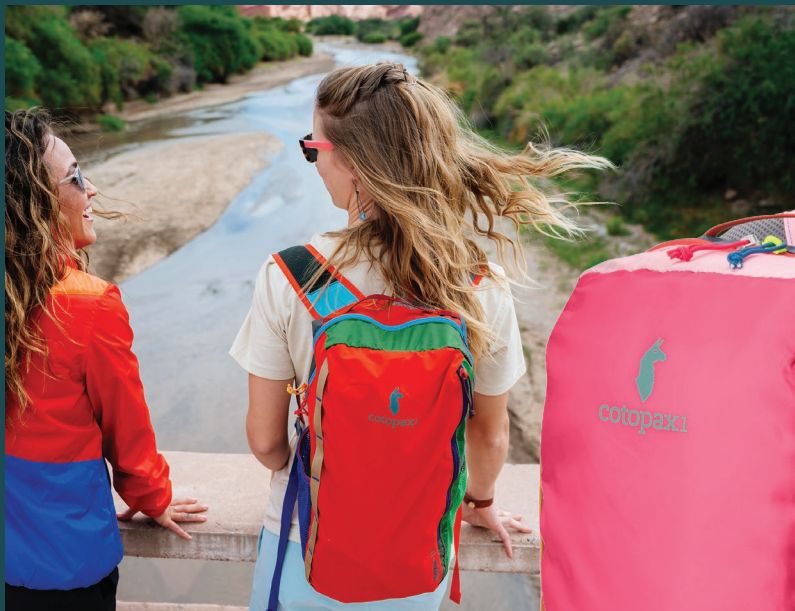
Cotopaxi Batac Backpack COTOBTP | Color: Surprise