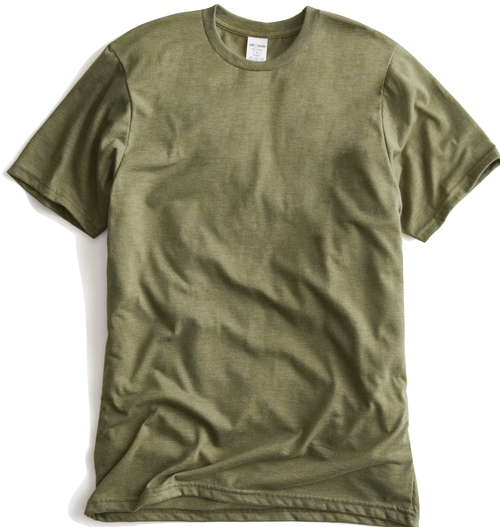
FREE Allmade® Unisex Tri-Blend Tee AL2004 | Unisex Sizes: XS-4XL | 9 colors

Feel your impact in this crazy-soft sustainable tees.