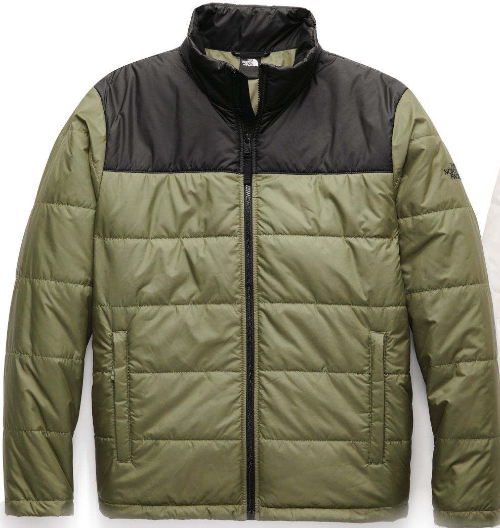
The North Face® Everyday Insulated Jacket NFOA529K | Adult Sizes: XS-3XL | 3 colors