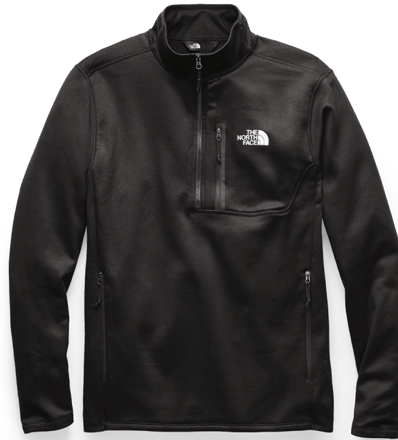
The North Face® Skyline 1/4-Zip Fleece Jacket NFOA7V63 Adult Sizes: XS-3XL 3 colors