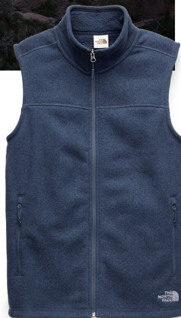
The North Face® Sweater Fleece Vest NFOA47FA Adult Sizes: S-3XL 3 Colors