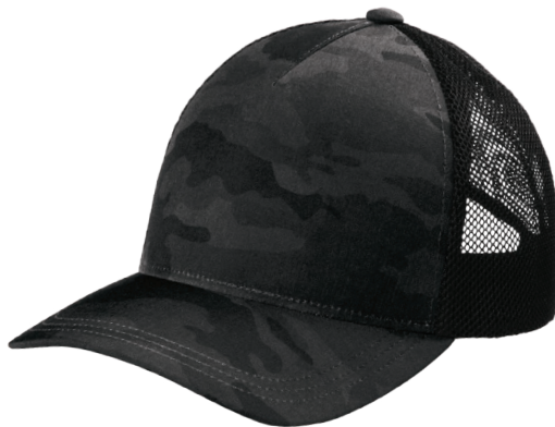
OGIO® Fusion Trucker Cap OG603 | One Size Fits Most | 3 colors