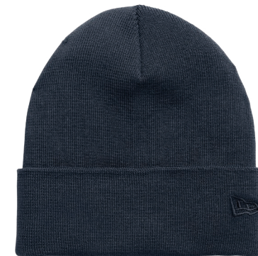
New Era® Recycled Cuff Beanie NE907 | One Size Fits Most | 3 colors