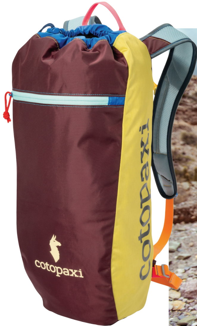
Cotopaxi Luzon Backpack COTOL18L | Color: Surprise

Each pack comes with a unique surprise color combination, made from a collection of fabric remnants.