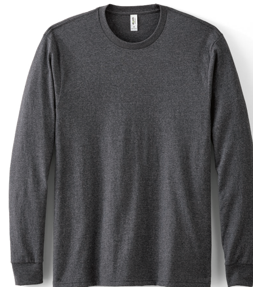
Allmade® Unisex Long Sleeve Recycled Blend Tee AL6204 | Unisex Sizes: XS-4XL | 3 Colors