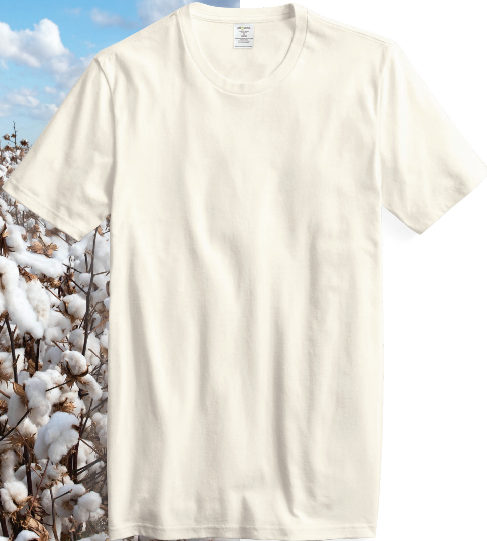
FREE Allmade® Unisex Organic Cotton Tee AL2100 | Unisex Sizes: XS-4XL | 8 colors