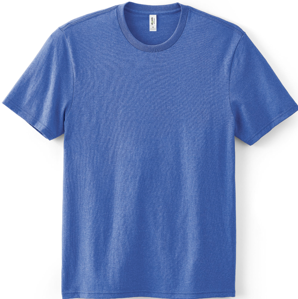
Allmade® Unisex Recycled Blend Tee AL2300 | Unisex Sizes: XS-4XL | 4 Colors