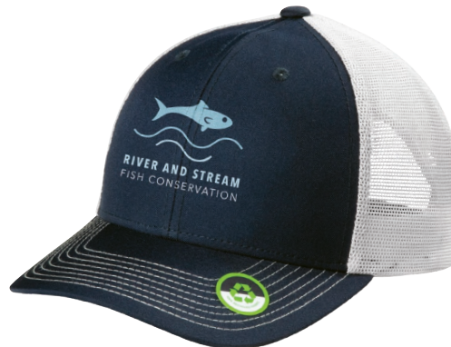
Port Authority® Eco Snapback Trucker Cap C112ECO | 5 colors