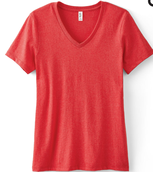
Allmade® Women's Recycled Blend V-Neck Tee AL2303 | Women's Sizes: XS-4XL | 4 Colors