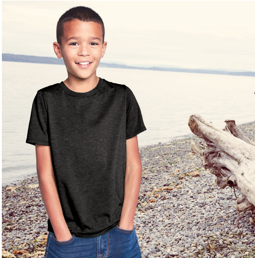
FREE District® Youth Re-Tee® DT8000Y | Youth Sizes XS-XL | 5 colors