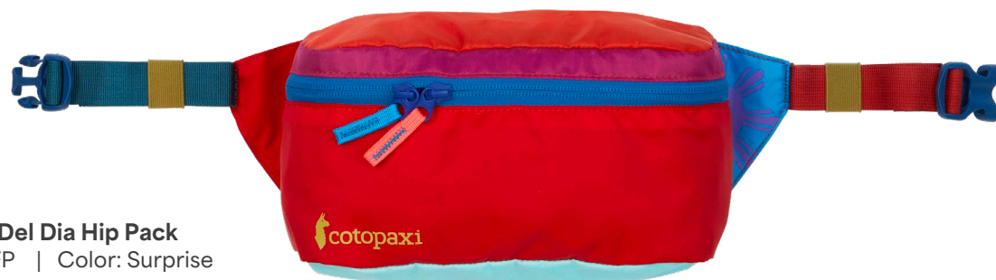
Cotopaxi Del Dia Hip Pack COTODDFP | Color: Surprise