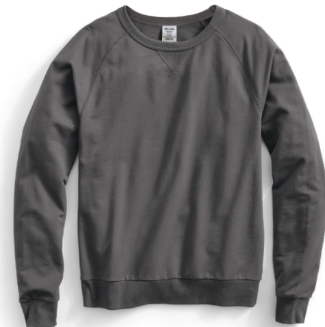
FREE Allmade® Unisex French Terry Crewneck Sweatshirt AL4004 | Unisex Sizes: XS-4XL | 4 colors