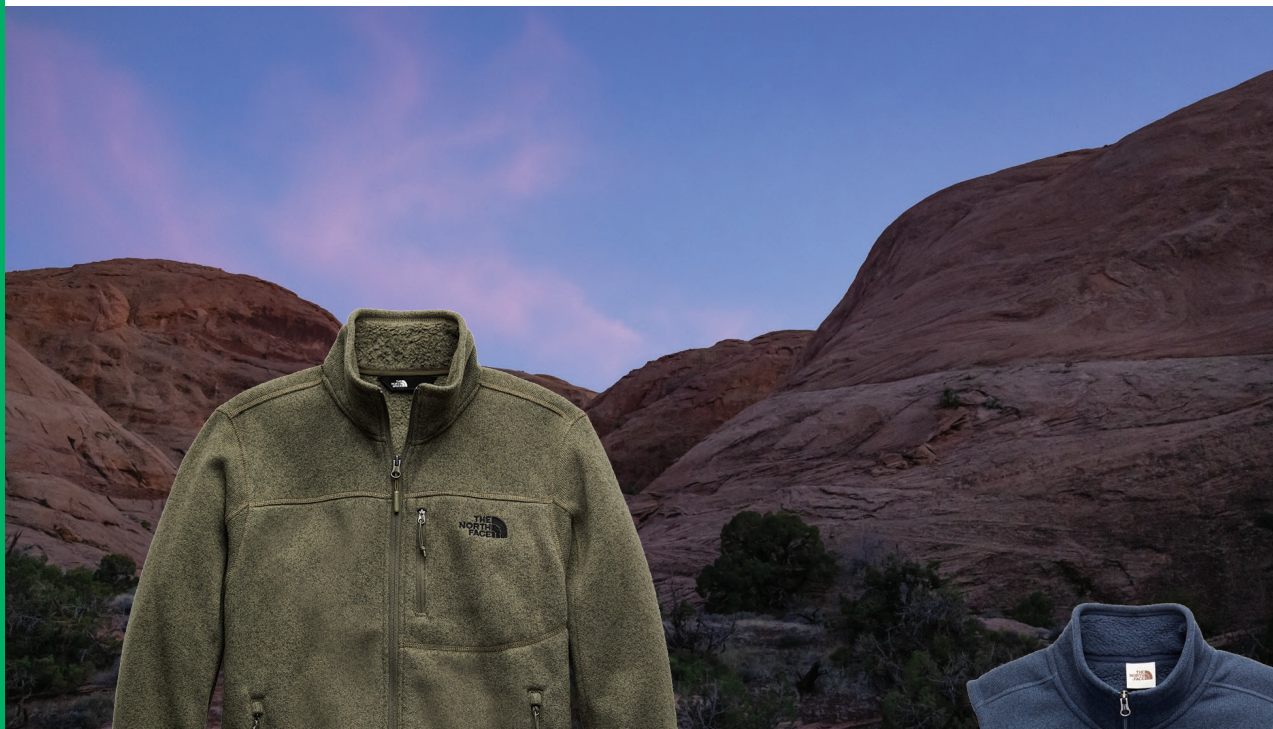
The North Face® Sweater Fleece Jacket NFOA3LH7 Adult Sizes: S-3XL 4 Colors