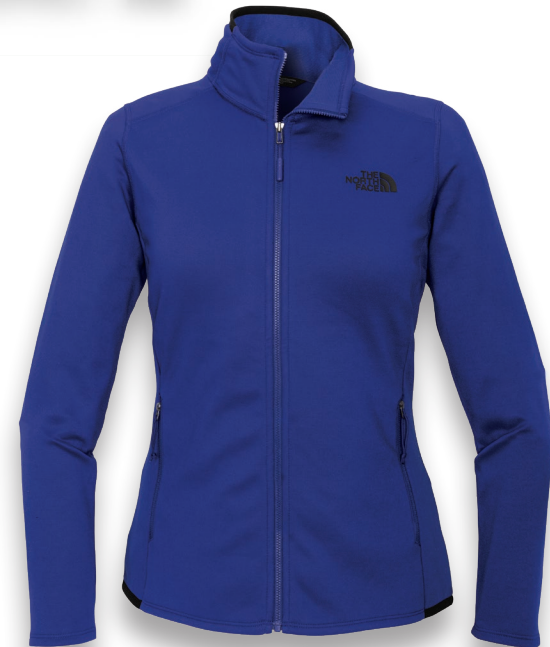
The North Face® Ladies Skyline Full-Zip Fleece Jacket NFOA7V62 | Ladies Sizes: S-2XL | 5 colors